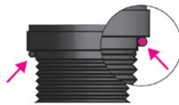
Check O-ring position