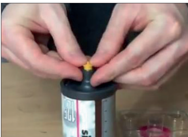
Insert the yellow non-return valve