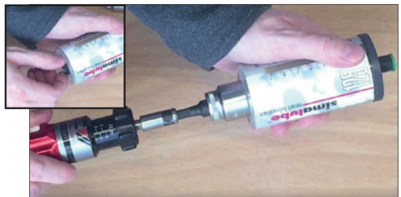
Screw in gas generator and tighten to 1.5-2.0 Nm