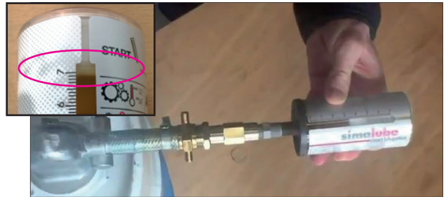
Fit the simalube onto the supply fitting and filling with oil. ⚠ Do NOT overfill!