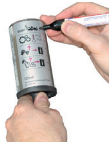
Mark lubricator with grease type